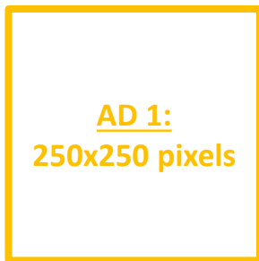
AD 1: 250x250 pixels