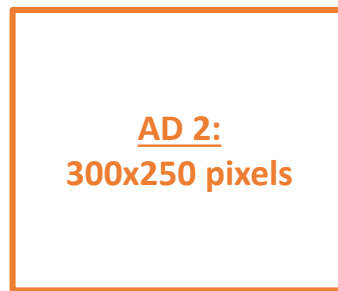
AD 2: 300x250 pixels